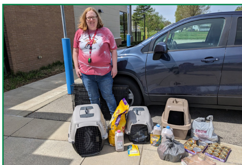
The Caped Crusaders Cat Rescue was presented with supplies collected for their organization during the Community Read.