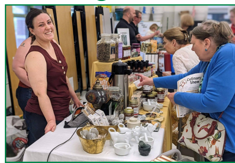
Back Home Again LLC, one of the vendors present at the Culinary Show, had many samples for attendees to try and purchase.