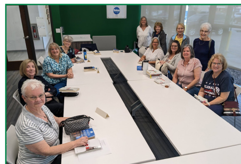
The Union branch had a wonderful group for their monthly "Hooked on Books" Club in April!