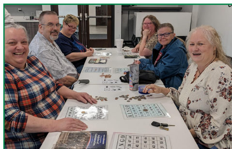
St. Clair patrons had a fun time during Book Bingo at the branch.