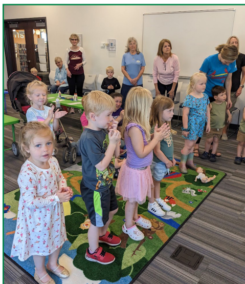
An animal-themed storytime was a hit at the Owensville branch. Young patrons listened to pet stories and made a paper cat to take home.