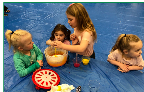
Scenic Regional Library participated in Messy Play Night at ECC on April 5.