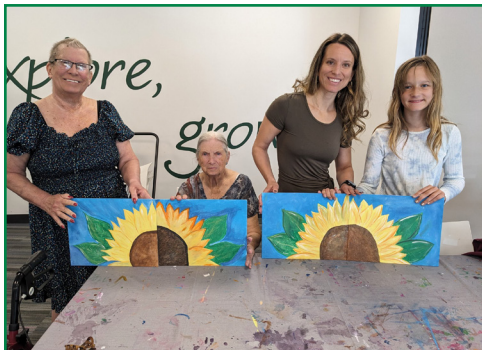
Mothers & daughters made matching sunflower paintings at the St. Clair branch. We even had a mother-daughter group of FOUR generations!