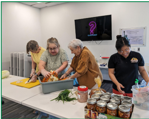
Thanks to Mabuhay Asian Cafe, the Owensville branch learned about the important Korean cultural food of kimchi and even got to make some.

The St. Clair branch's kick-off event will be from 11 am to 1 pm. Kids Bingo will take place from 11 am to noon, followed by adult Bingo, sno cones, and a clown twisting balloon animals from noon to 1 pm.