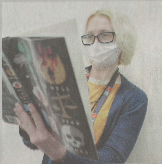
Natale LaPlant Union Scenic Regional Library

Favorite read of 2021: It's called "What the Hell Did I Just Read" by Jason Pargin. It's weird, improbable, strange, comedic fiction. The story follows these two paranormal investigators, but the way the author describes stuff is very unique. I couldn't put it down, and when I finished it, I asked myself exactly that question — what the hell did I just read?