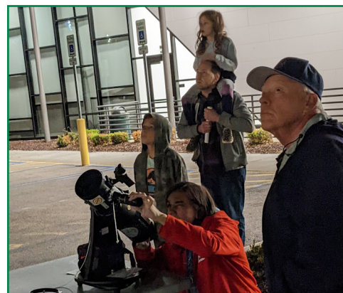
Union patrons enjoy all the wonders of the night sky during a Star Party hosted at the branch.

We love to be involved in the community! I am a member of the Franklin County Literacy Council and the Union Area Chamber of Commerce, so you can see me at various functions like Union Wingfest, the Franklin County Fair, and of course the upcoming Christmas Parade. We are busy decorating for Boo Bash and the YMCA Trunk or Treat!