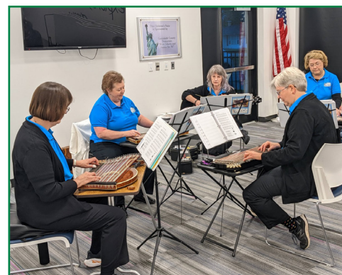
The Schwarzer Zither Ensemble of Washington performed at the Owensville branch and discussed the history of the zither.