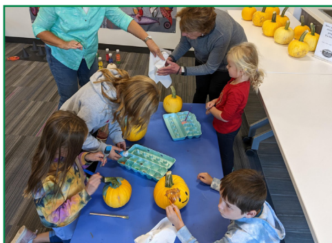
Families attended a pumpkin painting party at the branch complete with lots of Halloween-themed activities.

Wednesday, November 30 from 1:00 pm - 4:00 pm One-on-one help with your device.