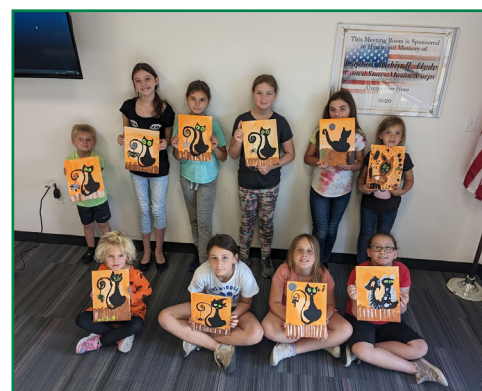
Kids Halloween Paint Night at the St. Clair branch featured a spooky black cat creation and Kool-Aid for all to enjoy!