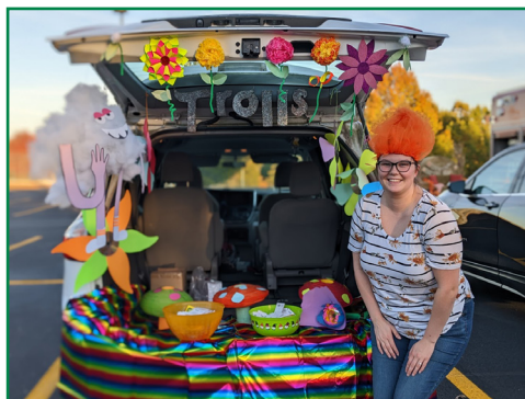
Scenic Regional Library participated in a Trunk-or-Treat in the Washington area with the library van. Happy Halloween!

This special Charlie Brown-themed storytime will be for all ages as we celebrate Thanksgiving.