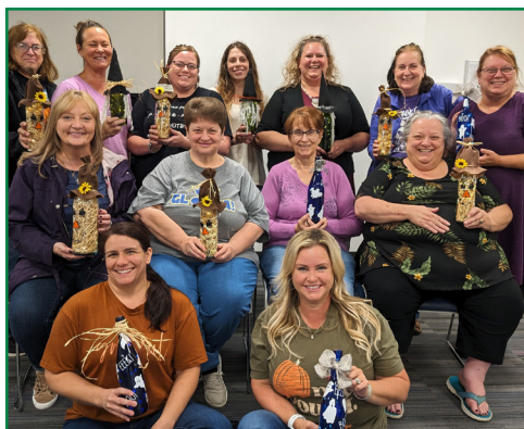
Our "Bottle of Boos" program held at the St. Clair branch was a fabulous success!