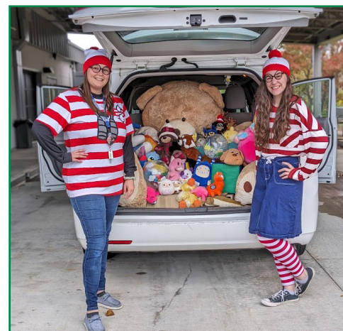
Scenic Regional Library participated in the Union Boo Bash.