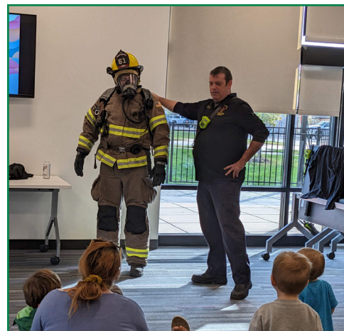
Thank you so much to our wonderful Pacific Fire Protection District for visiting the branch during storytime!

Come and visit the art gallery at the Hermann Branch! It is absolutely worth a drive to see. Many people have worked relentlessly to put together a very high-quality exhibit. Art galleries are important cultural experiences!