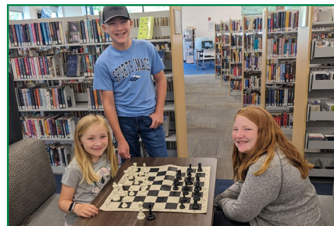
Hermann patrons enjoyed a game of chess together at the branch.