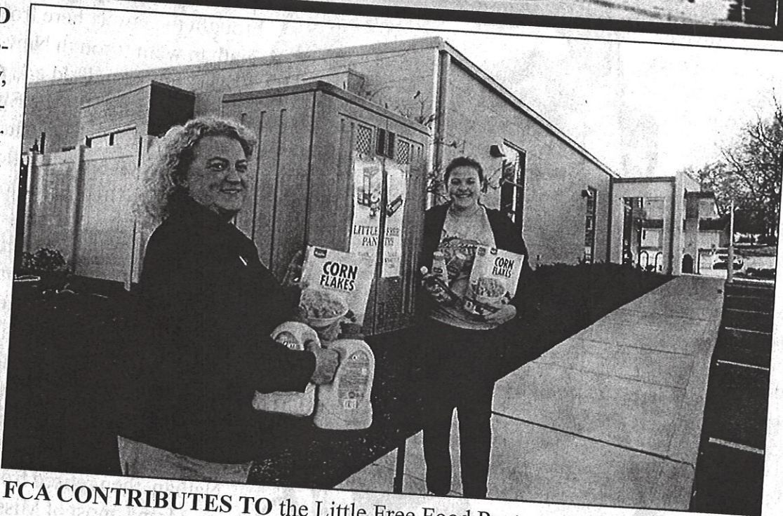
FCA CONTRIBUTES TO the Little Free Food Pantry at NH Library.