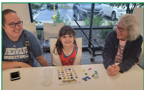
A blast was had by all at Wright City's Pokémon Bingo! A big THANK YOU to everyone who came!