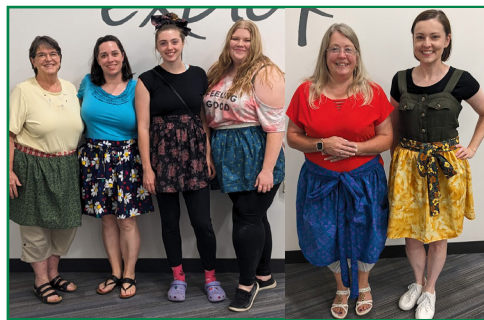
Patrons at the Union branch sewed waist aprons. Some wonderful comments said during the program: "I feel accomplished" and another ; "My Mother will be so proud."