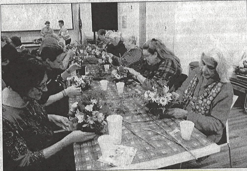
CRAFTING DECORATIONS — Attendees create tabletop centerpieces during a program hosted by the Warrenton Scenic Regional Library on Thursday, Dec. 19. Seats for the program were completely filled.